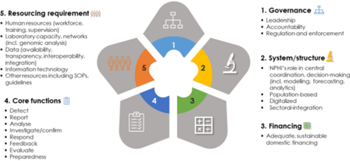
Figure 1. Conceptual framework of IDS developed for the project

The conceptual framework in Figure 1 guided the development of a standardized topic guide used in each of the deep dives. The thematic areas covered in the topic guide are provided in Annex 1. The framework is based on the initial WHO IDSR framework and incorporates Morgan et al.'s (2021) five principles of IDS to present an integrated vision of an IDS from organizational and operational aspects. It comprises five key domains: 1) governance, 2) system and structure, 3) financing, 4) core functions, and 5) resourcing requirements. The effect of integration and coherence across these five key domains, and the sub-domains captured in Figure 1, as well as the complementarity of each domain supporting the IDS operationalization in deep dive countries, were explored as part of this workflow.