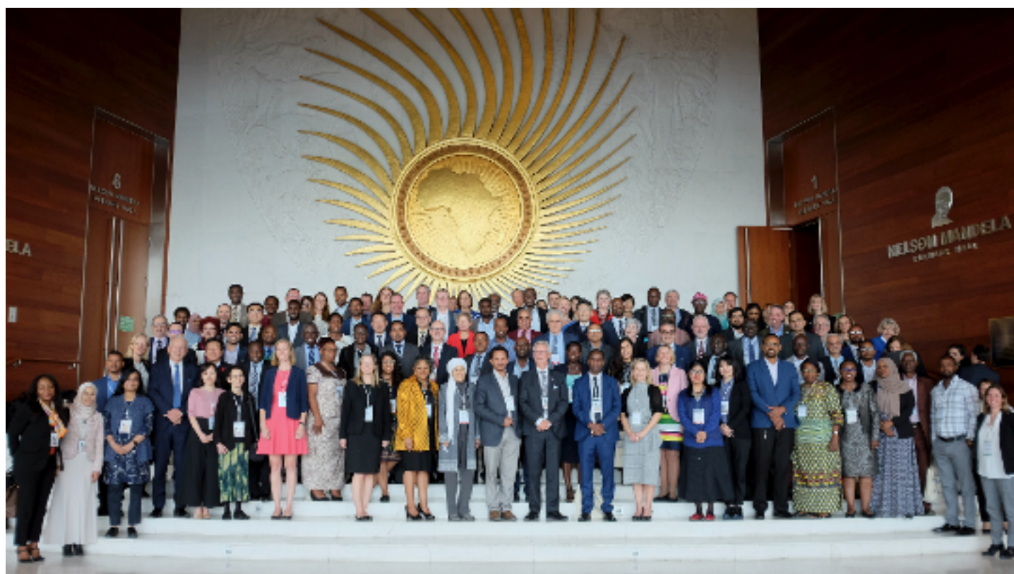
Group photo at the 2019 IANPHI Annual Meeting in Ethiopia

The 2019 IANPHI Annual Meeting took place in Addis Ababa, Ethiopia from December 3-6. More than 150 public health leaders from 59 countries attended the meeting hosted by the Ethiopian Public Health Institute and Africa Centres for Disease Control and Prevention.