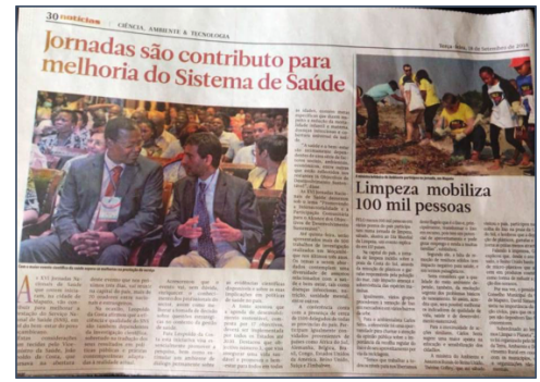
Media highlights of the opening ceremony, describing 16th Jornadas Nacionais de Saúde as an important forum for discussion of health policies to improve health system in Mozambique.

improving health and well-being in Mozambique. Conference sessions and presentations highlighted innovative strategies to engage local communities in public health as well as involved discussions about social determinants of health and inequities in Mozambique.