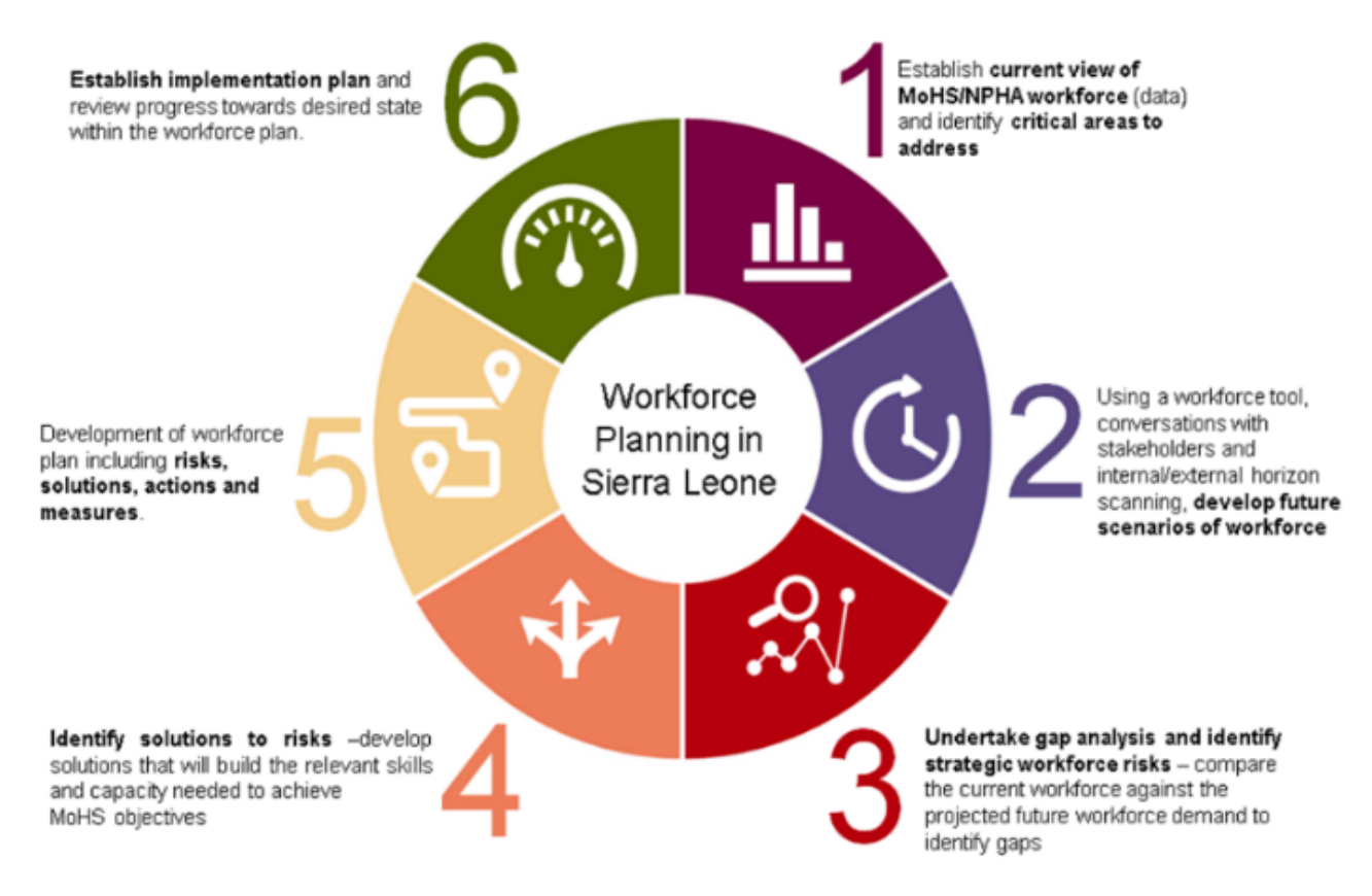
Figure 2: The 4 B's Approach