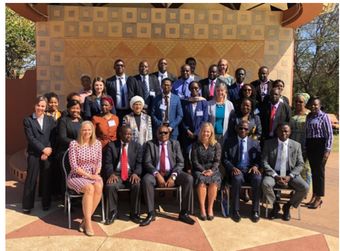
Group photo of participants from the meeting

Following this successful and productive meeting, interest was expressed in replicating this event in other regions. Click here for more information about Africa CDC's Regional Collaborating Centres.