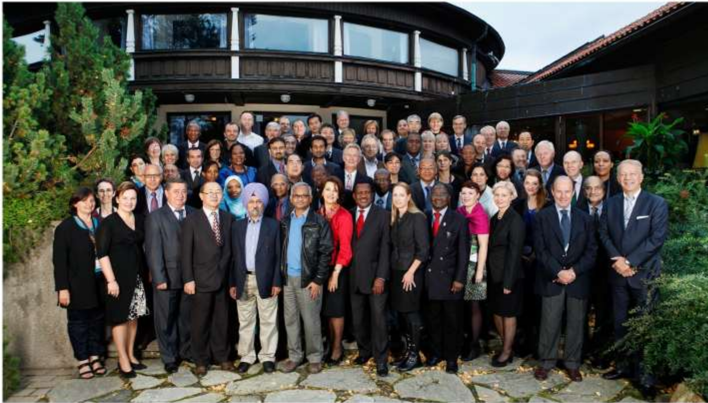
IANPHI Annual Meeting 2011 Helsinki