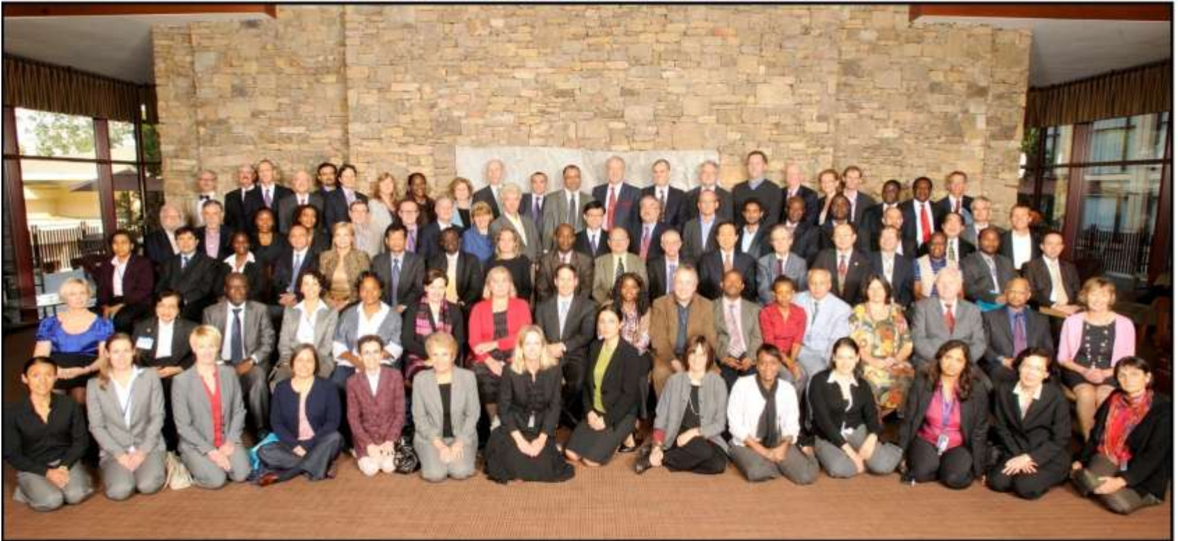
2010 IANPHI Annual Meeting