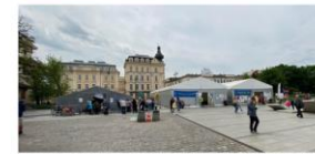
Temporary accommodation, kitchen and dining area, as well as clothes distribution point run by volunteers and charities in Krakow.

The conflict in Ukraine has triggered a serious humanitarian crisis that has resulted in one of the largest refugee movements in recent years. A neighbouring country to Ukraine, Poland has welcomed more than three million refugees, which left it facing a complex public health emergency.