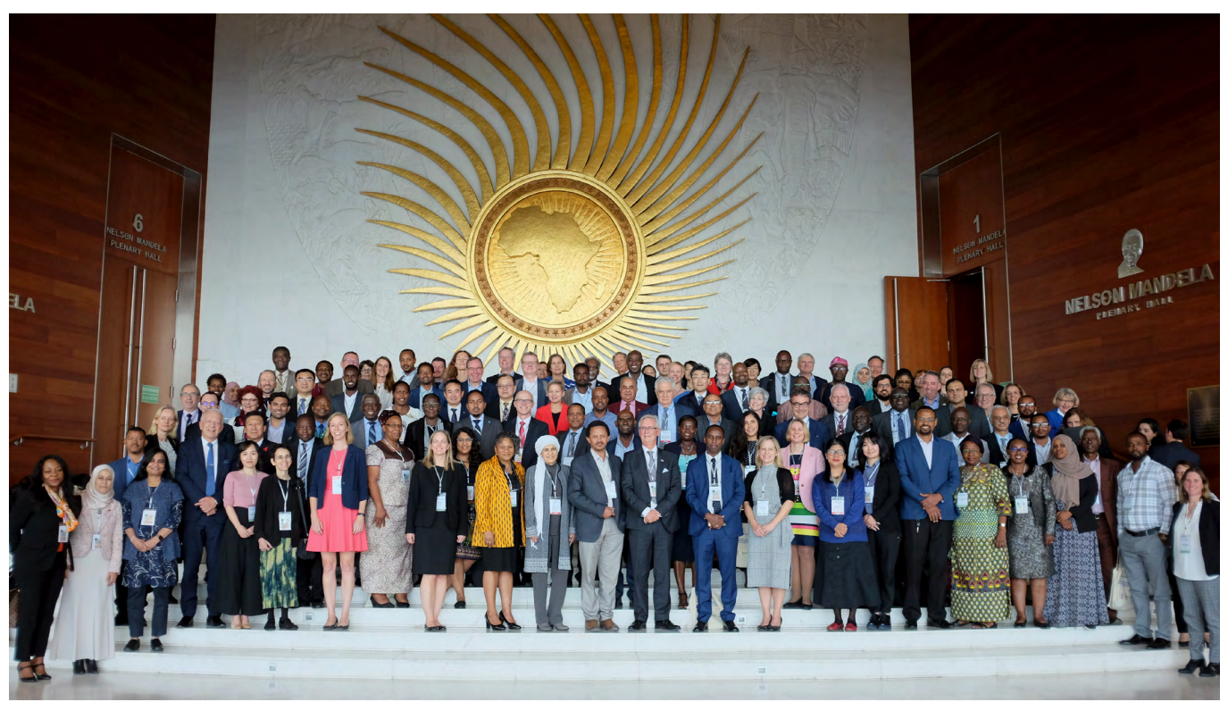
IANPHI Members at the 2019 IANPHI Annual Meeting in Addis Ababa, Ethiopia, in December 2019

IANPHI was formed in 2006 and has grown into a global network of 110 member institutions in 95 countries. The delivery of past strategic plans has supported the development of strong bonds of collaboration between public health institutes across the globe, developing resources and providing technical assistance to support institutional development and peer-to-peer support. IANPHI has fostered active communication between institute directors, developing a supportive community of practice of influential public health leaders who work to support governments on behalf of their populations.